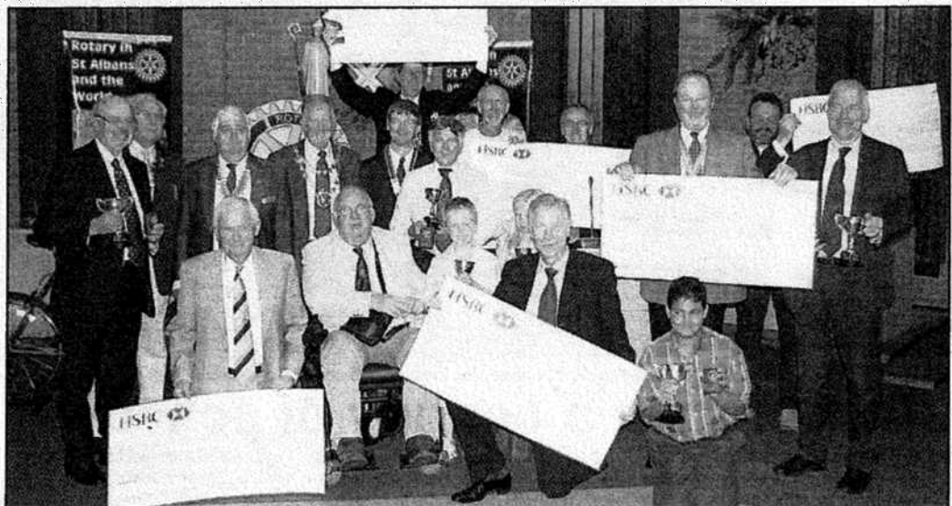
The winners of the trophies and the charity representatives at the Charity Cycle Ride presentation